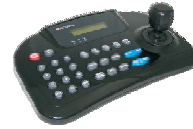
WTX-1200A (PTZ Controller) : Preset, Group, Tour, Swing, Pattern, Monitor setting, Menu, Speed control, Display, Interface convert.