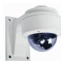
Wall Mount Bracket (MBR-401WM)